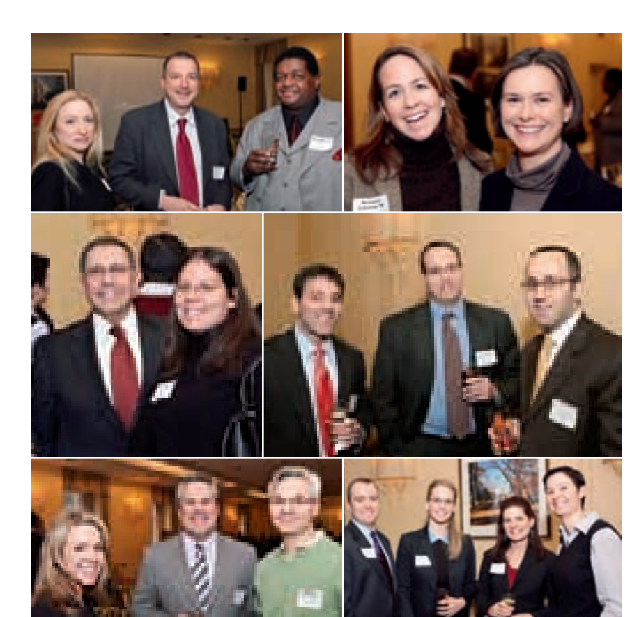
NEW YORK METROPOLITAN AREA

In January, record numbers of graduates, including many recent alumni, attended a luncheon at The Princeton Club of New York in midtown Manhattan.