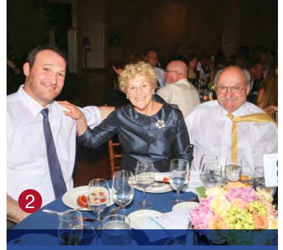
66 All four of my grandparents came from Russia through Ellis Island and, I suppose, through this very room on the way to their American dream. I think it's fair to say that Brooklyn Law School has played a huge part in my family's American dream."