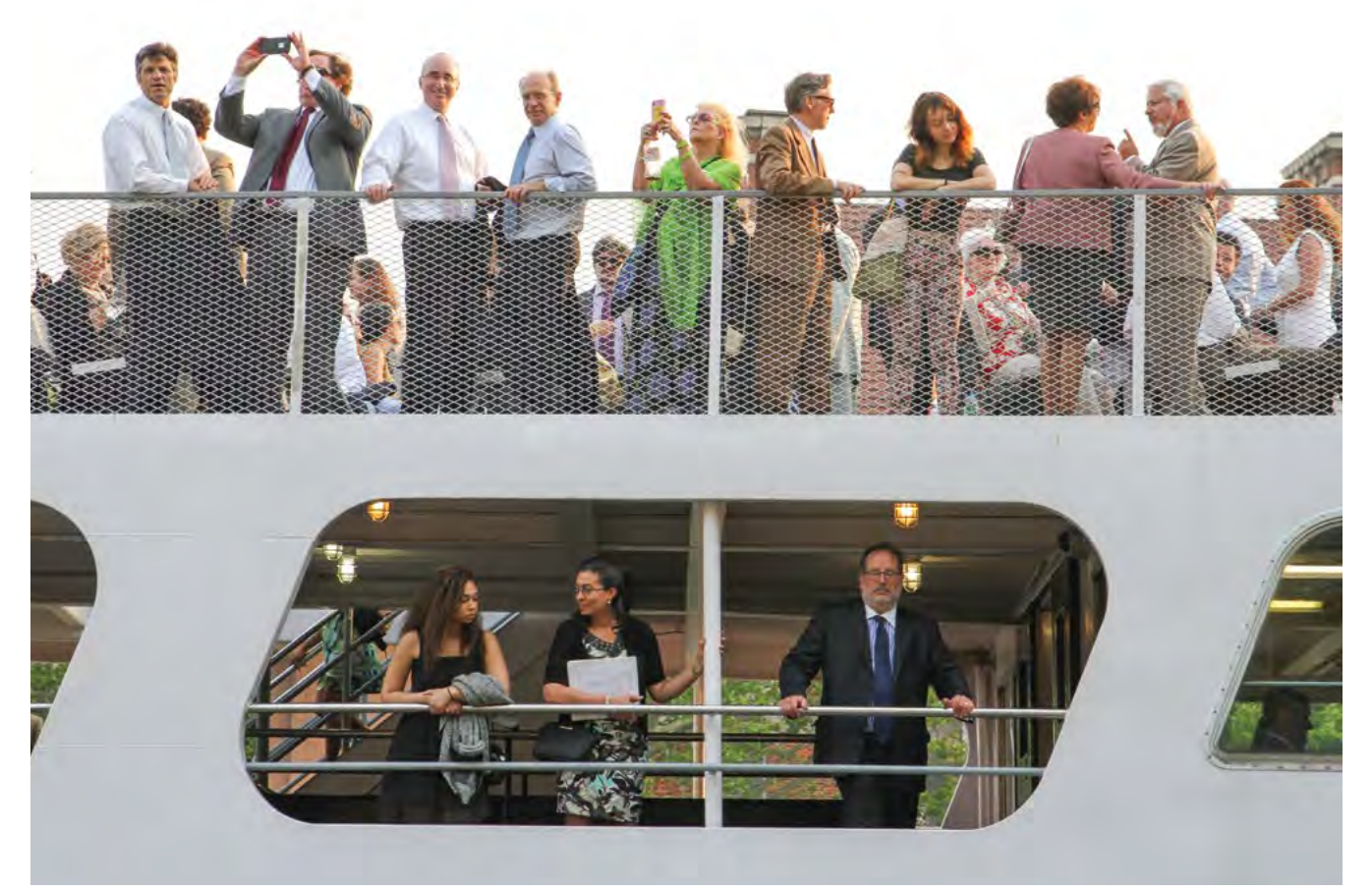
On the way to Ellis Island for the "Salute to Brooklyn Law School Icons" gala