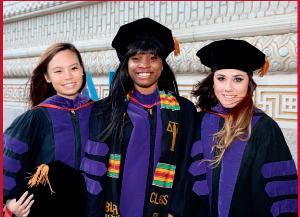
*Based on graduates seeking employment