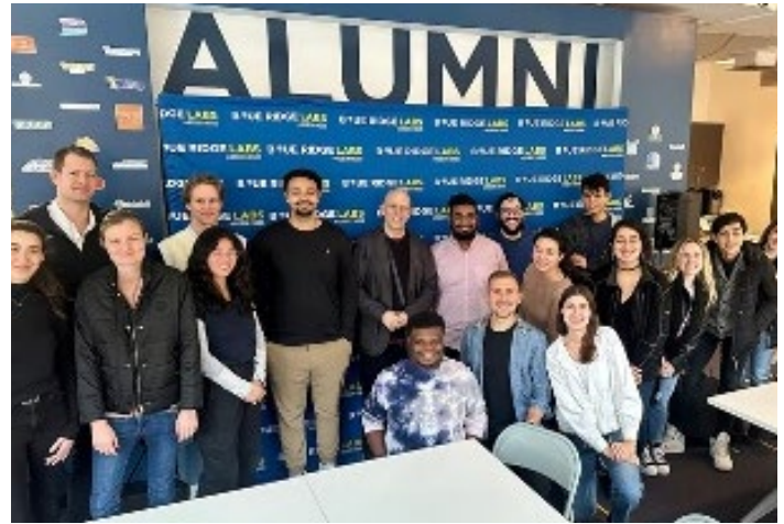
BLIP Students and Professors Travel to Blue Ridge Labs

Groups of NYU and BLIP students utilized their knowledge of design, technology, and the law to brainstorm potential improvements to existing democratic systems. BLIP students also met with Robinhood Foundation’s Blue Ridge Labs for civic tech startups. The BLIP crew spoke about a wide range of legal and business issues from corporate formation to IP protection to compliance and regulatory issues affecting ventures interacting with governments, schools, and civic organizations. BLIP also helped run Legal Issues for Startups events and entrepreneur consultations with the NY Public Library and Venable LLP at the central library later this semester.